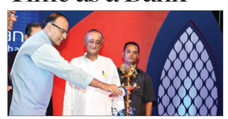
Arun Jaitley lights the ceremonial lamp in presence of Bengal FM Amit Mitra