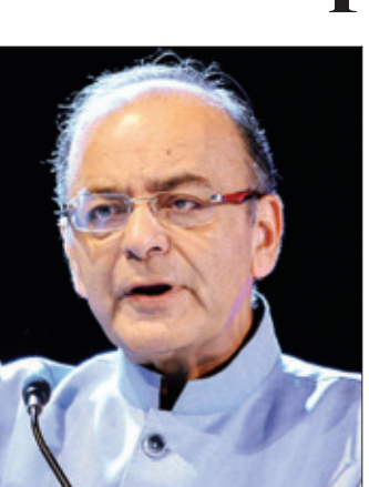
Union Finance Minister Arun Jaitley addresses the gathering

Underscoring the importance of economic activity in eastern states, Jaitley said that political differences between Bharatiya Janata Party and the Trinamool Congress would not block the way